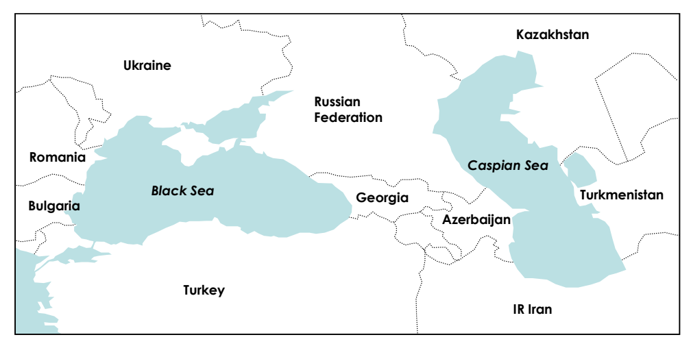
Figure 1: The Caspian Sea, Black Sea and Central Eurasia showing the littoral States.

The Oil Spill Preparedness Regional Initiative (OSPRI) was created out of an industry effort to coordinate improved oil spill preparedness in the Caspian Sea, Black Sea and Central Eurasia (see Figure 1). OSPRI was formalized by a Memorandum of Agreement through the Ipieca network on 1 August 2003 which was subsequently renewed in January 2009, January 2014, January 2019, and January 2024. bp, Chevron, ENI, ExxonMobil, KMG, NCOC, Shell and TotalEnergies were the OSPRI members during 2024; all OSPRI's direct expenditure is shared equally between them.